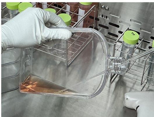
▲ Family Supernatant Manufacturing Process